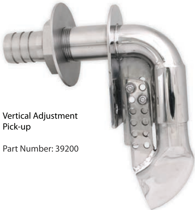
Vertical Adjustment Pick-up